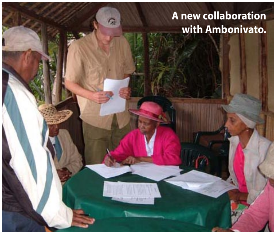
A new collaboration with Ambonivato.

A survey by the Dept. of Topography confirmed that the land belonged to Parc Ivoloïna, but in an agreement reached with MFG the villagers were given the right