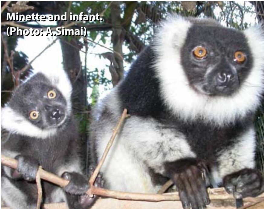
Minette and infant.