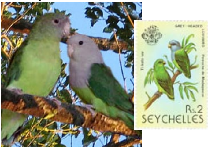
Madagascar's smallest parrot – the grey-headed lovebird.

The sparsely wooded model-station and forest-clearing/ cropland of the SRI area provide ideal habitat for the grey-headed lovebird ( Agapornis cana cana ). Despite being uncommon in the east of Madagascar, at Ivoloina these endemic lovebirds are particularly easy to see at this time of year, sometimes in mixed flocks, as they are attracted to loose rice in the threshing areas. Sadly, outside protected areas this attractive small green parrot (the name refers to the males' head) is commonly caught and sold in the pet trade (Langrand 1990).