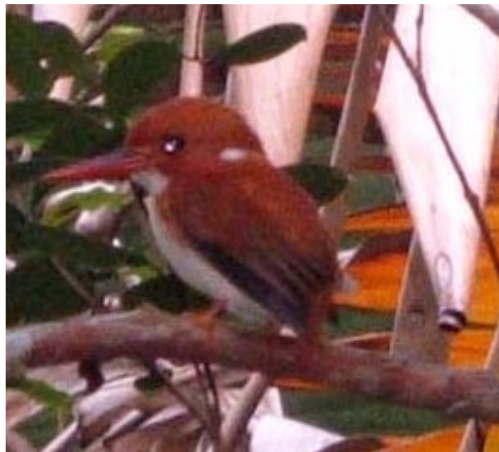
Pygmy kingfisher ( Ispidina madagascariensis ) – one of many relatively unresearched birds found at Betampona.