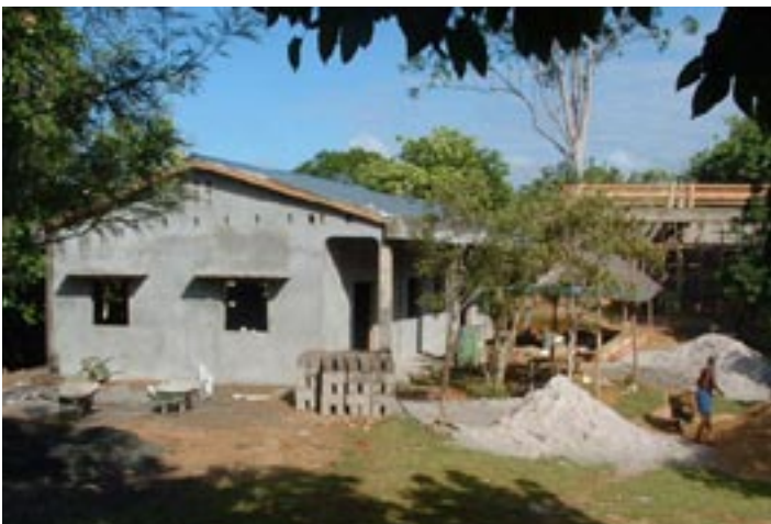
The training centre – ahead of schedule.